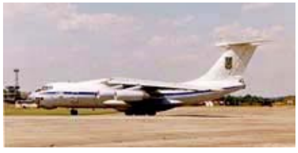
The Russian Ilyushin at Tel Aviv airport, awaiting installation of the Phalcon radar

It appears likely that the matter will continue to fester unless Israeli Prime Minister Ehud Barak terminates the deal. At the end of June 2000, the House Appropriations Committee voiced strong objections to the deal, and endorsed a non-binding resolution calling on Israel to terminate the existing US$ 250 million contract for the first