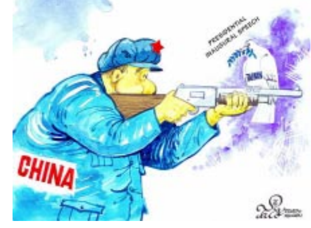
erendum to change the status quo in regards to the question of independence or unification. Furthermore, the abolition of the National Reunification Council or the National Reunification Guidelines will not be an issue.

Therefore, as long as the CCP regime has no intention to use military force against Taiwan, I pledge that during my term in office, I will not declare independence, I will not change the national title, I will not push forth the inclusion of the so-called "state-tostate" description in the Constitution, and I will not promote a ref-