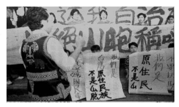
Taiwan aborigines: "We are aborigines, not mountain compatriots."

On 21 Mav 1992, some 700 aborigines held a protest in front of the Chungshan Hall Yangmingshan, where the National Assembly meeting. was The crowd waved banners such as "We are aborigines" and "Protest racism", and at-