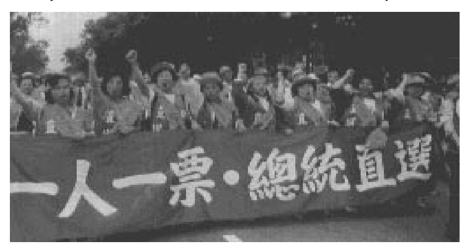
Female DPP National Assembly-members demonstrating in Taipei: "One person, one vote: direct presidential elections."

The refusal by the Kuomintang authorities to discuss serious constitutional reforms during the 70-day special session of the National Assembly ending on 30 May 1992, and the attempts by a number of KMT Assembly-members to use the session to enhance their own powers, have led to a paralysis in the Constitutional reform process and calls for the abolishment of the National Assembly.