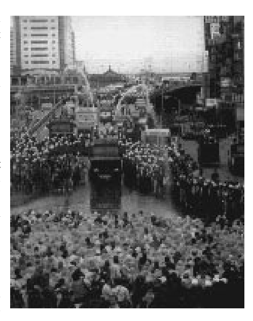
Riot police and water cannon in action

The police also displayed an interesting "dual strategy" in dispersing the crowd: on the surface they exercised constraint by picking off the demonstrators one by one, and carrying them away. On the other hand, a number of