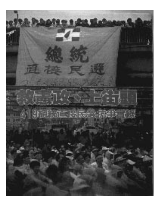
Banner reading: "For direct Presidential elections."

On the first day, the protest went peacefully. They started from the Taipei City Stadium near Tunghua North Road, wound their way through downtown Taipei, and returned to the Stadium to spent the night in preparation for next day's demonstration.