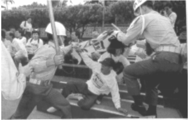
Military police beating students

Originally, the Alliance planned to hold a large demonstration on 10 October, to coincide with a military parade organized by the authorities on the occasion of the “Double Ten” celebrations commemorating the 1911 uprising against the Manchu Dynasty in China. However, the Alliance changed its plans on 8 October, after a peaceful sit-in by