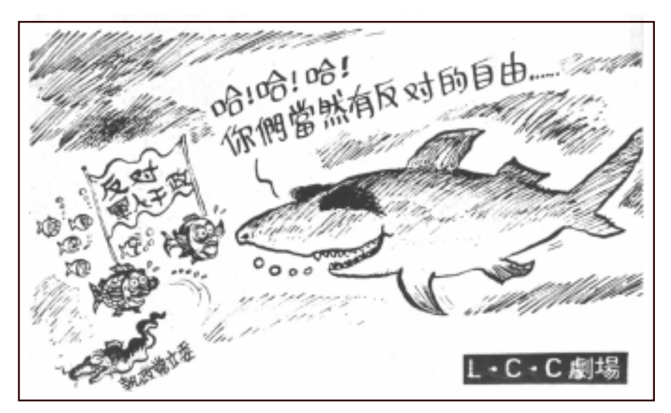
Little fish: "Oppose military interference in politics." Big Shark: "Ha, Ha! Of course you have freedom of expression, but....."

The street parade, which began around 2 PM, wound its way through the center of Taipei and returned to the Chiang Kai-shek Memorial without any incident around 6 PM. The demonstration ended by unveiling a new "Wild Lily" made of stainless steel, the symbol of student movement in March. The students renamed the square in front of the Chiang Kai-shek Memorial as Wild Lily Democracy Square .