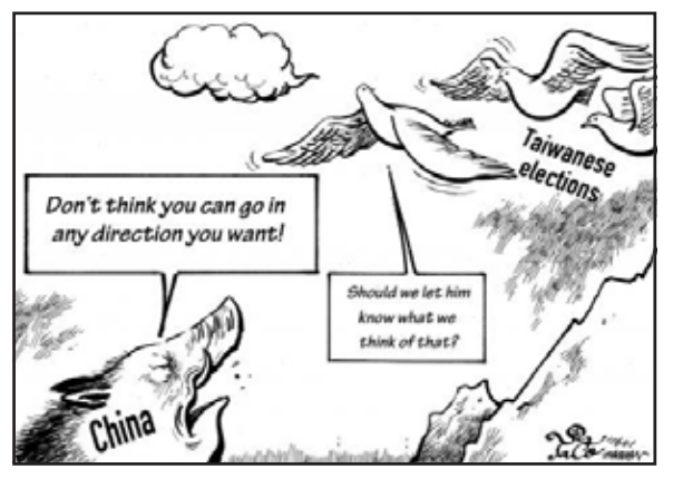
China: Don't think you can go any direction you want! Taiwanese election doves: Should we let him know what we think of that?

What is needed in Washington—and in European capitals—is a recalibration of existing policies regarding Taiwan, so it can focus on